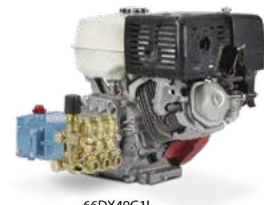
66DX40G1I installed on gas engine