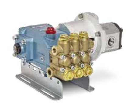
5CP3120CSS pump with 76SAEA2.5CP bell housing and SAE "A" motor