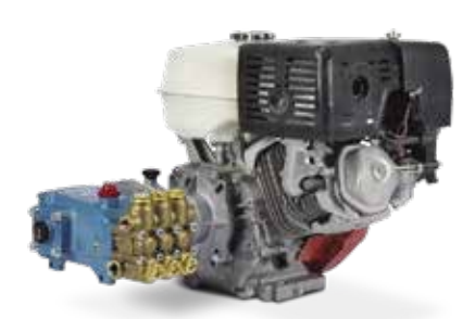
5CP3120CSSG1 installed on gas engine