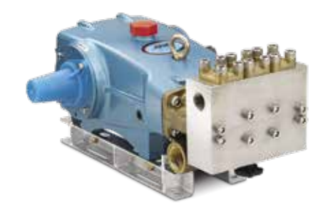
3560 Rated at 25 gpm to 3,000 psi or 20 gpm at 4,000 psi