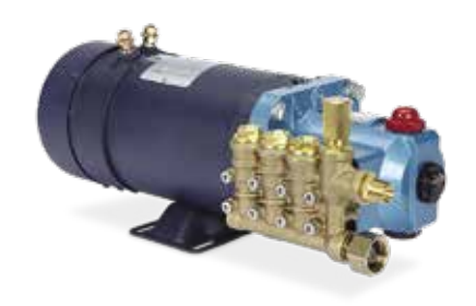
4DX15EUF with 12 VDC motor